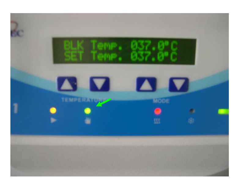
Figure 4: When the target temperature has been reached, as indicated by the display and the green "ready"-indicator glowing steadily (green arrow), the block cooler is ready to be used.