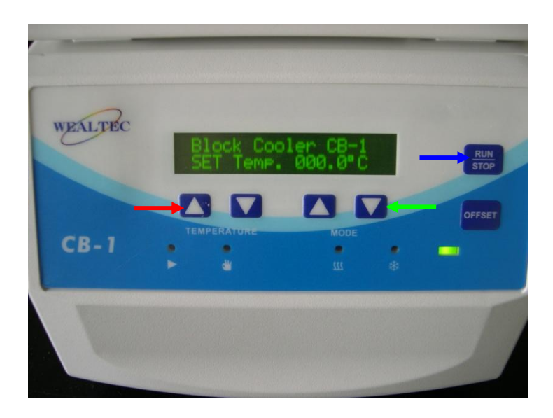
Figure 2: Set one of the pre-programmed temperatures by pressing on the "up/down" arrows above "MODE" (green arrow). For fine-tuning or customised temperature setting, press the "Up/down" arrows above "TEMPERATURE" (red arrow). To start heating or cooling, press the "RUN/STOP"-button (blue arrow).