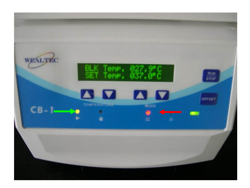
Figure 3: The display will show the set temperature (SET), as well as the current block temperature (BLK). When in heating mode, the red "heat"-indicator (red arrow), as well as the "power"-indicator (green arrow) are lit.