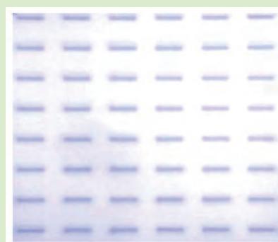
Protein sample transfer onto NC membrane by Smart Blotter