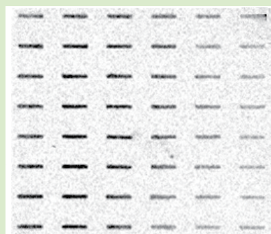
Western Blot of serial diluted protein samples transferred onto NC membrane by Smart Blotter